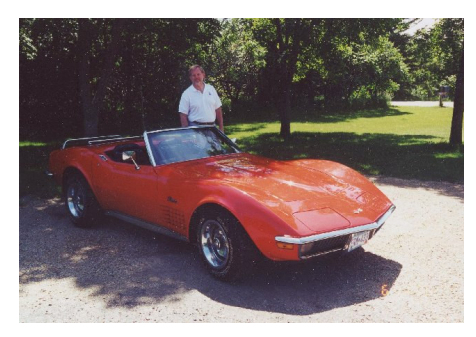
Norsky 1970 Monza Red Convertible 350/300 4-speed