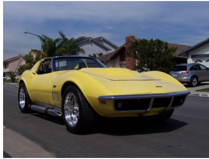
Daytona69 1969 Daytona Yellow Coupe 350/355 4-speed