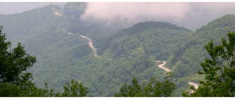
A couple of views of the Cherohala Skyway.

Tentatively scheduled for Saturday after lunch is a drive on a section of US 129, affectionately known as the "Tail of the Dragon", a 12-mile stretch of 131 twists and turns that is guaranteed to give you white knuckles. It starts at Chilhowee Lake, TN, a short drive from the hotel, and ends near Deal's Gap, NC, just over the state line. Then you can either turn around and drive it back, or take a long "pleasant" drive on the Cherohala Skyway, a scenic curving highway through the mountains. It winds up 5400-foot mountains for 15 miles in NC and then descends for 21 miles into the deeply forested backcountry of TN. There are no facilities along this stretch of road, so be sure you have a full tank of fuel when you start. This road is extremely popular with the motorcycle crowd. And with 20,000 Hondas expected to visit Knoxville the week of June 19, we can expect to see a few on the road. WARNING: if you take this drive, don't be lulled into exceeding the speed limit on the curves. There may be a slow moving tractor-trailer just around the next curve, taking up both lanes. And the truck will win that race every time.