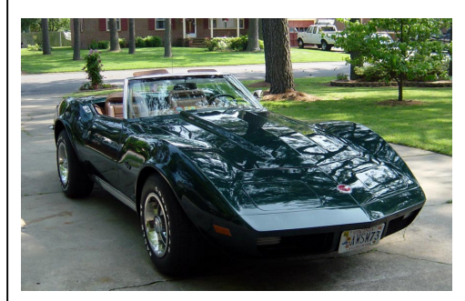
2 cruzn 1973 Blue-Green Convertible 454/275 4-speed

Congratulations to 2 cruzn and Daytona69 for their tie for first place in the second half of the 2005 C3VR On-line C3 Vette Car Show. And to Norsky for a close 3rd place finish. The 2006 first half contest will accept entries until 11:59 PM AZT, May 31, 2006, so submit your entry when you are ready. Voting will start at 12:00 AM, June 1 and end at 11:59 PM on June 30. Entry fee is $5.00, unless you are a Gold or Lifetime member, and then it is free. Nice prizes for the top three vote getters.